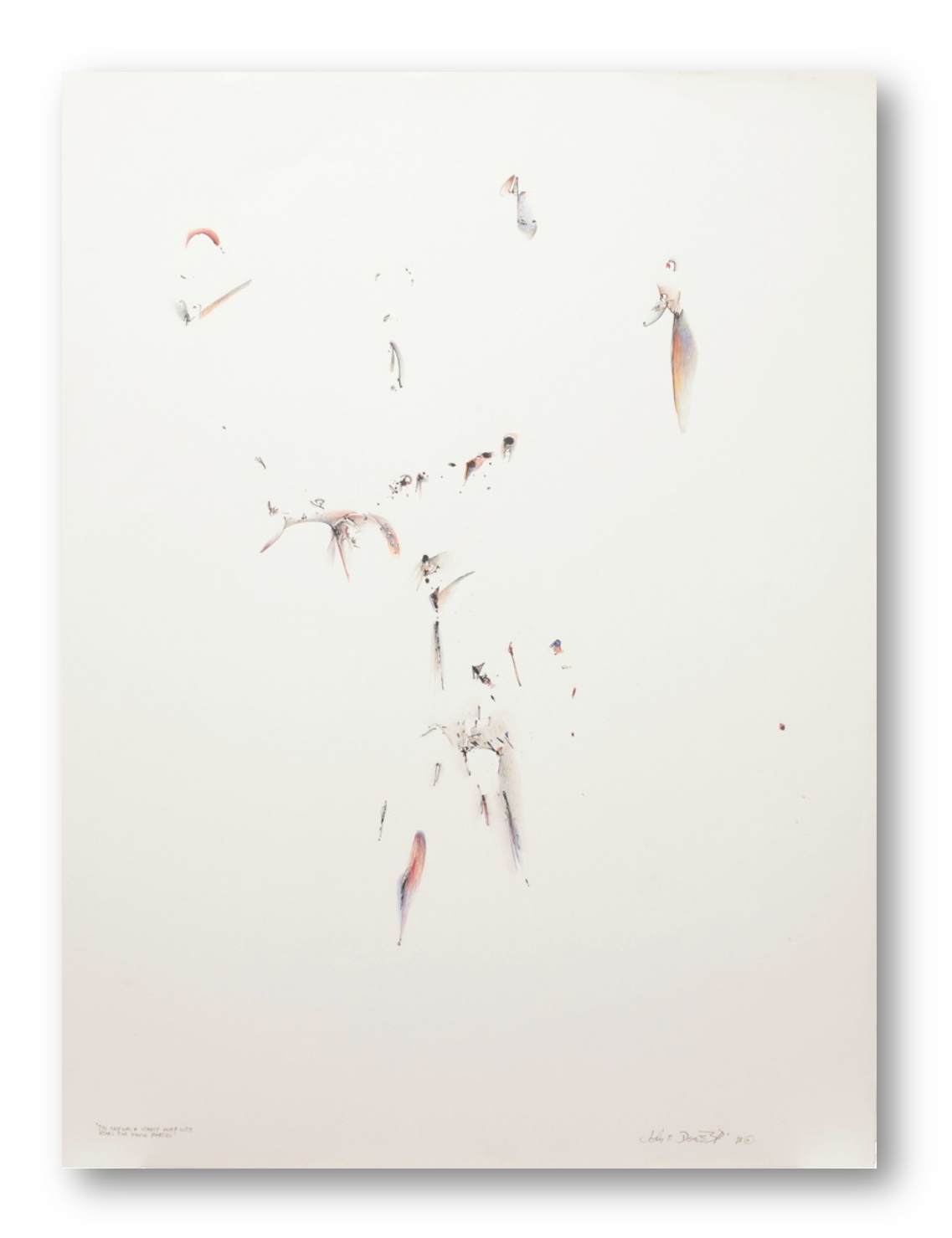
John Dowell, The Sky Was a Street Map with Stars for House Parties , 1991, watercolor & ink on paper 30" x 22", $15,000 (framed)