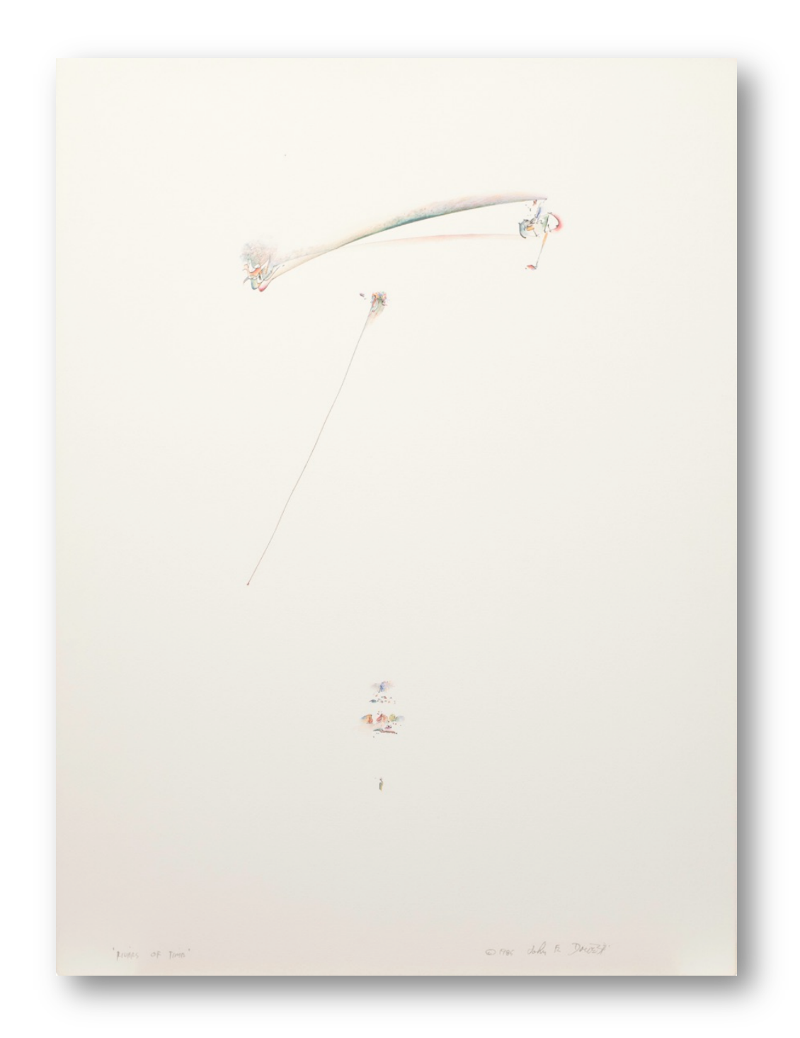
John Dowell, Rivers of Time , 1985, watercolor & ink on paper, 30" x 22" $15,000 (framed)