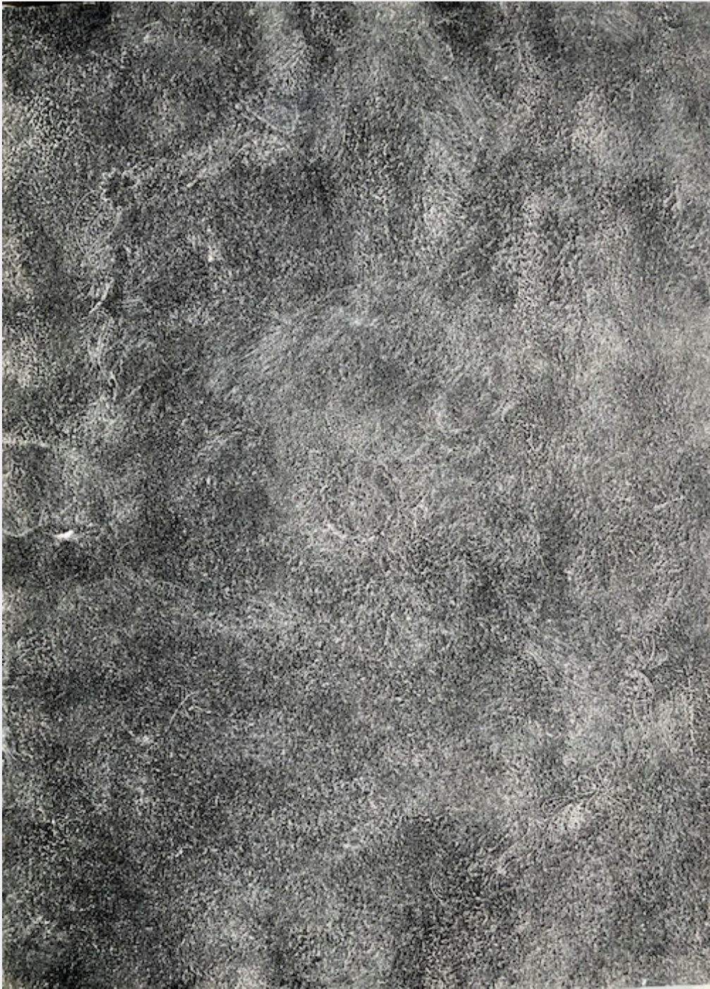
Cincuenta 5 , 2017, acrylic and sumi ink on handmade Khadi paper from India, 30" x 22" $3,800 (unframed)