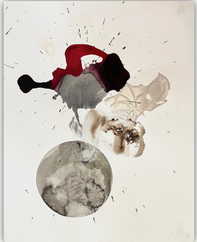
Rhythm Hut 20, 2013 sumi inks, India inks, & walnut inks on paper 14" x 11" (framed) $1,200