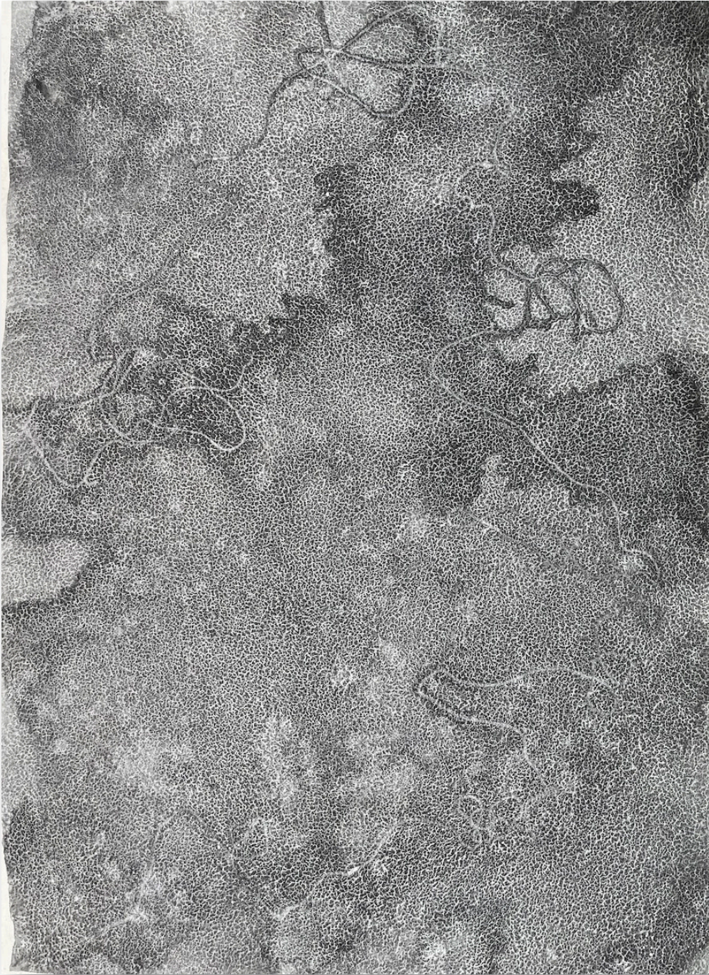
Cincuenta 1 , 2017, acrylic and sumi ink on handmade Khadi paper from India, 30" x 22" $4,200 (framed)