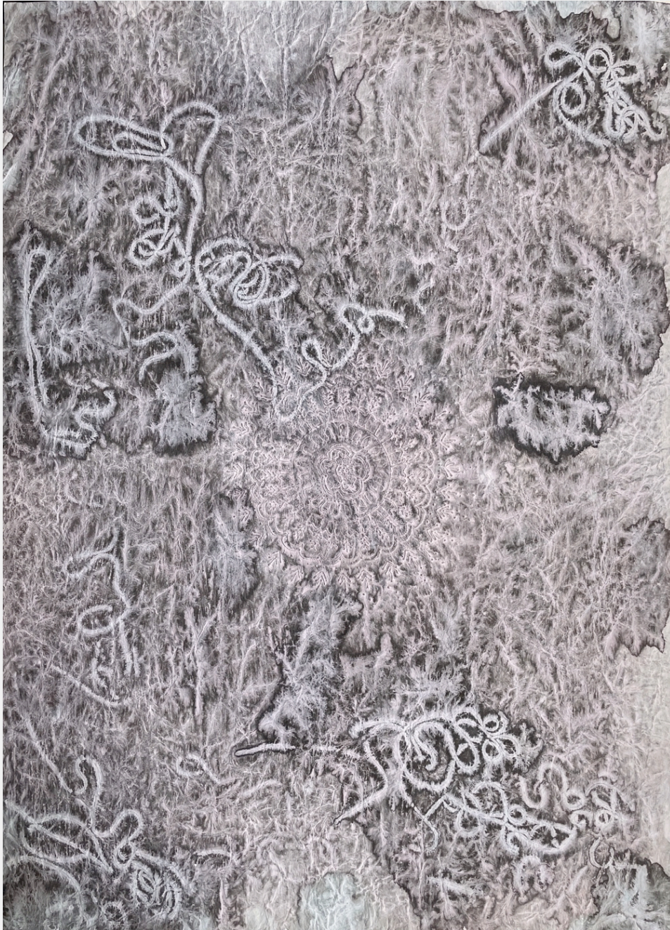
Cincuenta 4 , 2017, acrylic and sumi ink on handmade Khadi paper from India, 30" x 22" $4,200 (framed)