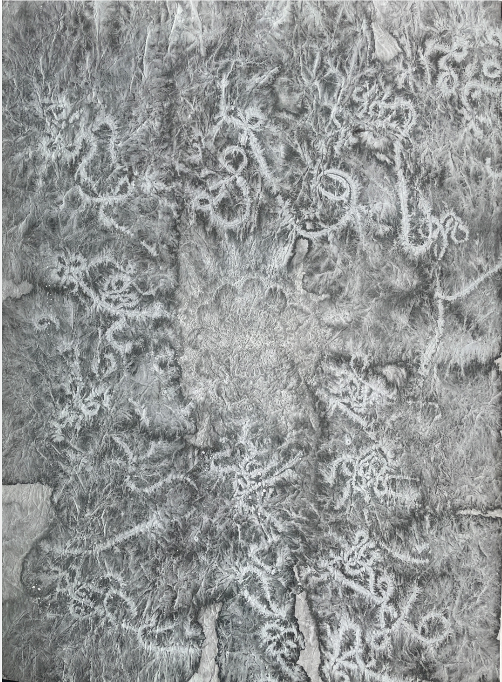
Cincuenta 2 , 2017, acrylic and sumi ink on handmade Khadi paper from India, 30" x 22" $3,800 (unframed)