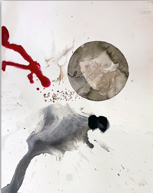
Rhythm Hut 17, 2013 sumi inks, India inks, & walnut inks on paper 14" x 11" (framed) $1,200